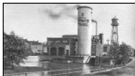
Kuenzel Mills – S. Washington St.

Several new items have been added to our merchandise "catalog". See these items in color on our website: www.newbremenhistory.org/Catalog.htm .