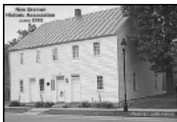
NBHA Museum – 120 N. Main St.

NON-PROFIT ORG. U.S. POSTAGE PAID New Bremen, OH 45869 Permit No. 41