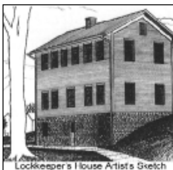
Lockkeeper's House Artists Sketch