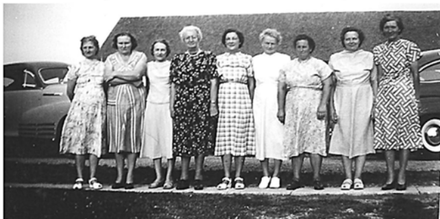
FARM BUREAU COUNCIL (Dressed Backwards - Women)

[Picture taken at Elmer Stienecker's farm]