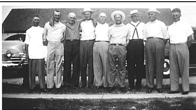
FARM BUREAU COUNCIL (Dressed Backwards - Men)