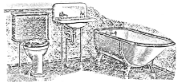
SEARS, ROEBUCK & CO.

We sent to Sears & Roebuck for one of those bathrooms you hear people are having in houses. It took a plumber to put it in shape. On one side of the bathroom is a great long thing like a pig trough, only you get in it and wash all over. Over on the other side is a little white thing they call a sink where you wash your face and hands.